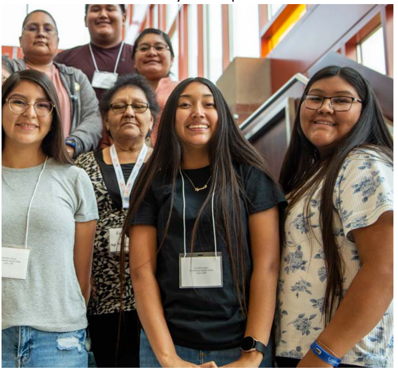
Community Health Representatives

This project supported key opportunities for the career advancement of indigenous healthcare professionals, helping them achieve their goals of obtaining advance certification and training through place-based, accessible and affordable healthcare education and certification. This approach improved both individual professional careers and the healthcare services of the tribal communities served by these professionals.