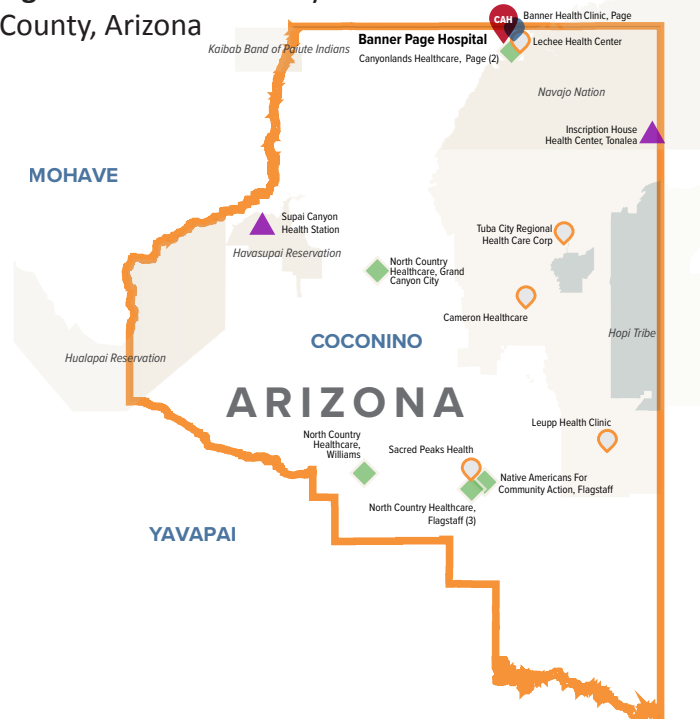
Fig 2. Rural Health Safety Net Facilities in Coconino County, Arizona

https://www.ihs.gov/Phoenix/healthcarefacilities/coloradoriver/