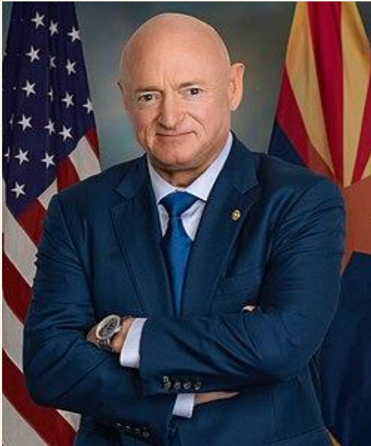
Senator Mark Kelly